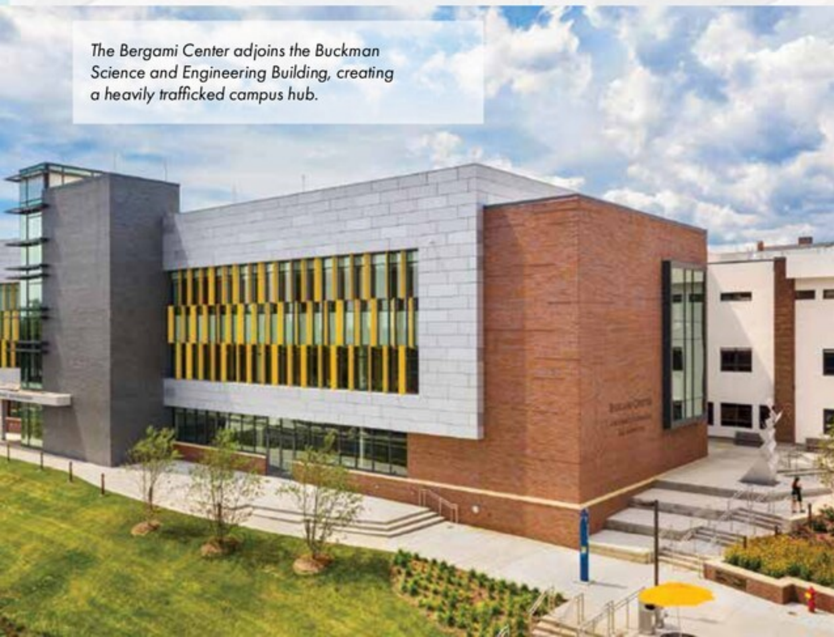
The Bergami Center adjoins the Buckman Science and Engineering Building, creating a heavily trafficked campus hub.